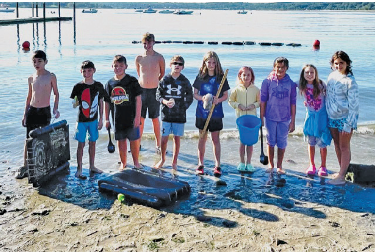
Bayville Scouts helping to improve our water and marine habitat.

Back in the spring, the scouts assembled oyster gardens, which are basically plastic cages with holes small enough to keep juvenile oysters (i.e., seed) inside and predators out. In June, oyster gardens were each loaded with about 500 juvenile oysters, acquired from Cornell Cooperative Extension, and then moored about 50 feet off shore. Using calipers, the scouts measured the size of 20 oysters and calculated an average before the gardens were moored. The initial average was about half a centimeter. Every two weeks the scouts ventured down to West Harbor, swam out and retrieved their respective gardens from the water, cleaned the gardens to remove algae build-up, and took measurements and calculated new averages. By the end of September the oysters had grown to 4 to 5 centimeters and were taken to the Cold Spring Harbor spawning area for permanent placement that is protected from harvest. The scouts not only had a great learning experience, but had a lot of fun too!