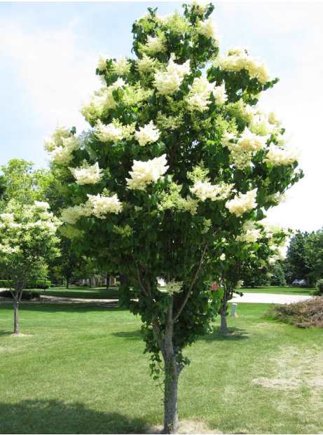
New Japanese Lilac Tree

As a result of the generous donations we received from the residents in our community, the Bayville Beautification Committee is continuing our work on the tree replacement and the landscaping project in the islands in the Village. The tree stumps were removed and, in the near future, the new trees will be planted in time for spring blooms. The fall plantings are adding beautiful color throughout the Village and soon we will be decorating for the holidays. The gazebo that was formerly located by the bridge has been moved to the Creek Beach for your enjoyment and viewing pleasure. Thank you for your continued support and we would like to wish all of you a happy and healthy holiday season!