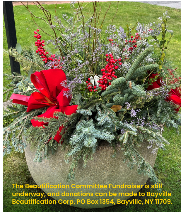
The Beautification Committee Fundraiser is still underway, and donations can be made to Bayville Beautification Corp, PO Box 1354, Bayville, NY 11709.

Wishing everyone a Merry Christmas and Happy Holidays!