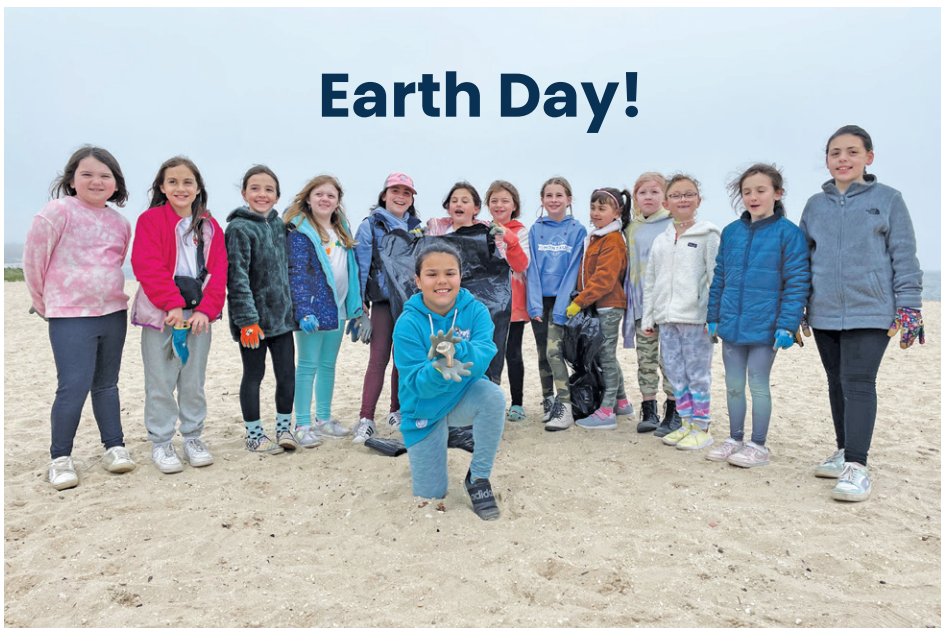
ABOVE: 3rd Grade Girls Participating in the Beach Clean Up for Earth Day

In effort to address the potential effects of sea level rise on United States national wildlife refuges, the U. S. Fish and Wildlife Service carried out a Sea Level Affecting on Marshes Model (SLAMM) for wetlands in the Oyster Bay complex. Using the results of this model, the Village is working with Warren Pinnacle to develop a marsh conservation plan for our coastal wetlands. As the Village works on various projects for flooding and coastal defense, healthy marsh systems are one of the best natural barriers for coastal communities to protect against storm surge and inundation. The BECC is actively involved in the development of the Marsh Conservation Plan with other stakeholders, including the Long Island Sound Study and New York Sea Grant.