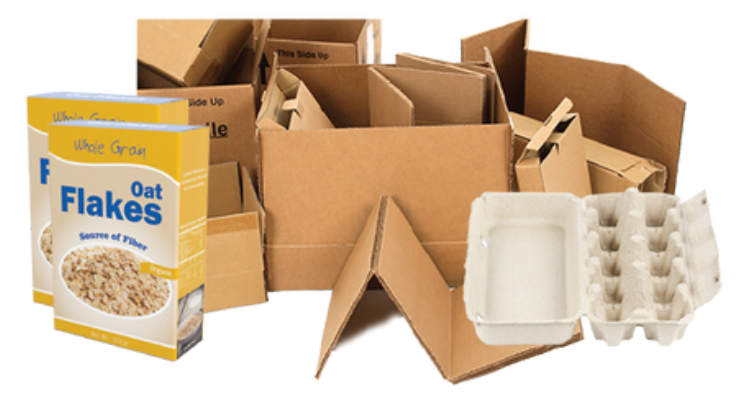
Cardboard, Paper Containers & Cartons