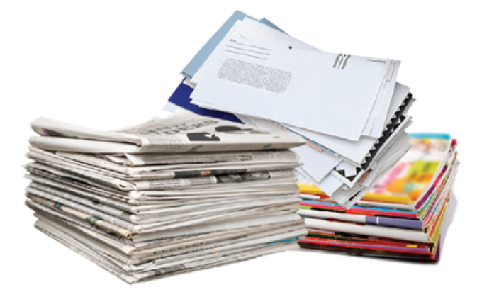
Paper, Newspaper, Magazines & Junk Mail (No Need to Tie or Bundle)