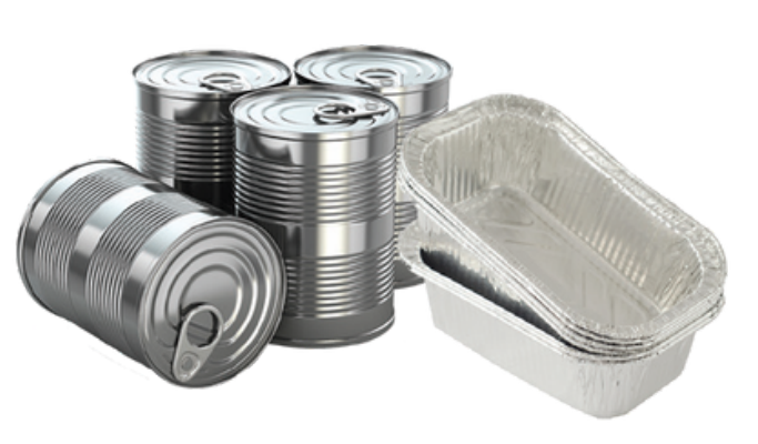
Metal Cans, Aluminum Containers & Foil (Rinse & Clean)