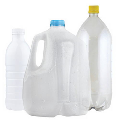
Plastic Bottles, Milk Jugs, Detergent Bottles & Containers (Plastic 🏠 🏠 🏠)